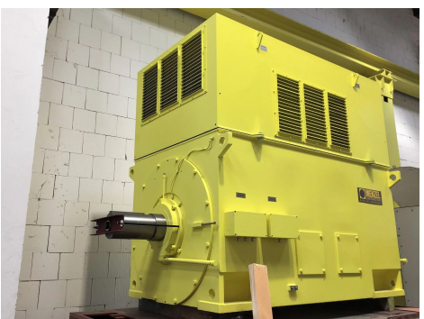
Fig.: MENZEL make Three phase inductor motor for water pumping application in fertilizer plant.